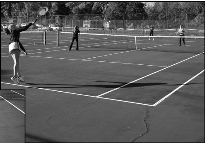
Base repairs will be completed on the district's tennis courts and a new surface installed as they continue to be utilized by students for physical education classes and tennis teams, as well as community members, throughout the year.