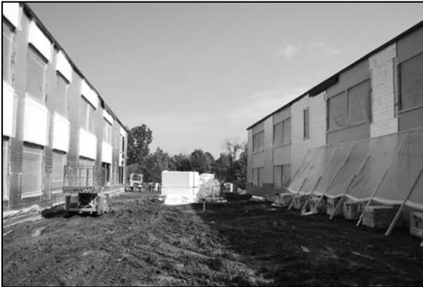
There are two classroom wings extending to the east of the new building that are two stories high, each containing groupings of class levels.

The students at the current Milton Terrace South Elementary School have had the unique opportunity to assist with choosing a new name for the school that they will occupy next fall. "Milton Terrace South Elementary School" will be phased out as the district completes the construction of a new elementary school building. The students at each grade level researched various historical figures and local sites that have played an important role in the history of Ballston Spa. The top school names selected by the students included Spa Landing Elementary, Gordon Creek Elementary, Brookside Elementary, Iron Springs Elementary, and Ballston Springs Elementary. The top three names selected by a student vote in November will then be submitted to the Superintendent and the Board of Education for their consideration in the coming months.