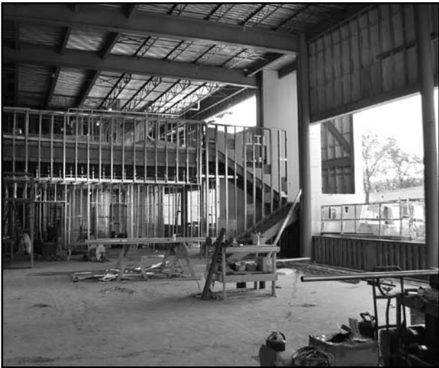
The new elementary school contains a modern media center to serve the needs of the students, including a loft area on the second floor.

Additional Phase 1 improvements that have been approved and are scheduled to begin in the summer of 2013 include improvements at both the Malta Avenue and Milton Terrace North Elementary Schools. Plans for Malta Avenue include a complete interior renovation to the Pine Street building, constructing connectors between the Pine Street and Grove Street buildings, ADA accessibility, asbestos abatement, envelope & exterior structural repairs including replacing windows, foundation repairs, mechanical and electrical system repairs and upgrades and related site improvements to address drainage. At Milton Terrace North, the improvements include reconstruction of open classrooms, asbestos abatement, and mechanical and electrical system repairs and upgrades.