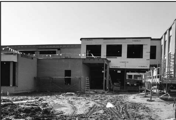
The east entrance to the new school building will provide access from a staff parking area and a drop off area for parents.

Drawings and renderings of the proposed plans, detailed information about the scope of work, including question and answer documents, tax impact, and construction timeline are located on the facilities planning pages of the district website at www.bscsd.org.