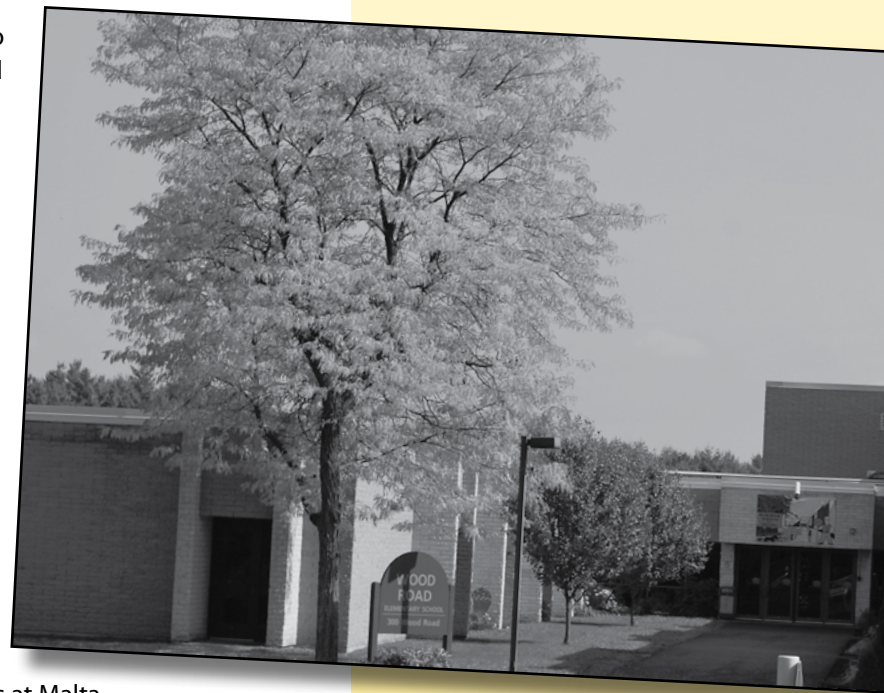
The current Wood Road Elementary School building was built and first utilized as the Ballston Spa Middle School in the 1970's.