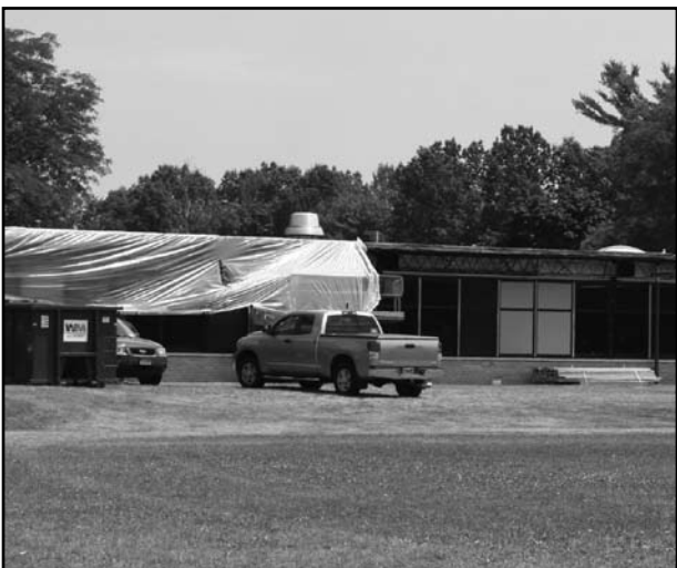
Windows and soffits were replaced in the rear wing of the Middle School building were completed during the summer of 2012, with additional work outlined in Phase 1 being scheduled over the next two summers.

The Middle School renovations and improvements focused on health, safety and energy efficiency, include replacing windows, asbestos and lead abatement, reconstructing exterior roof soffits, upgrading classroom ventilation systems, lighting & power upgrades and new classroom ceilings. The project is being implemented in three stages over the course of three summers to minimize the disruption to the students during the regular school year. The first phase of this work was completed on the west wing of the building in the summer of 2012.