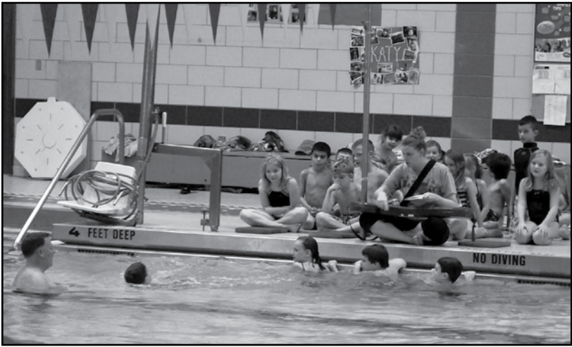
All students in the district utilize the swimming pool as part of their physical education classes, starting with swim lessons in the elementary grades to several related electives in the 11 th and 12 th grades such as lifeguarding courses.

Shall the proposition set forth in the notice of the Special District Meeting (a) authorizing the Board of Education to expand the capital improvement project that was approved by the voters on October 19, 2010 to include additional reconstruction of the Wood Road Elementary School and reconstruction of the pool, track and tennis courts at the High School at a maximum estimated cost of $8,900,000, including preliminary costs and costs incidental thereto and the financing thereof, (b) providing that $1,400,000 of such cost be withdrawn from the District’s Capital Reserve Fund, and (c) providing that an additional $7,500,000, or so much thereof as may be necessary after deducting New York State Building Aid, be raised by the levy of a tax to be collected in annual installments, with obligations of the District to be issued in anticipation thereof, be approved?