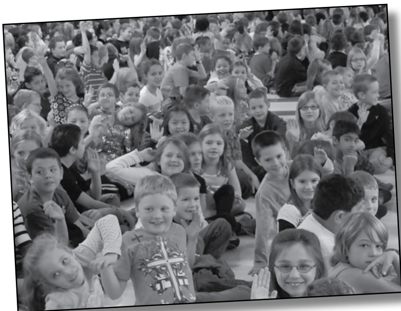
The students in Milton Terrace South Elementary School are currently researching and voting on a name to recommend for their new elementary school, scheduled to be completed for the 2013-14 school year.