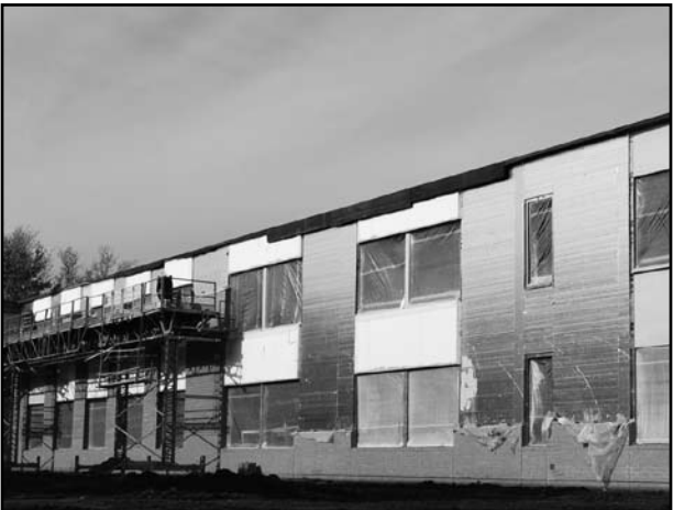
The new elementary school's brick facade is currently being installed, along with the windows, as the building's exterior structure is completed and work moves to the interior during the winter months.

Last spring, the district implemented the first phase of our facilities construction and renovations approved by district residents in the fall of 2010. Construction of the new elementary school building, to replace the current Milton Terrace South Elementary School, and related site development at the Wood Road complex started in March 2012. The new two-story building contains classrooms and support facilities to house students in grades Pre-K through 5. It was more cost effective to replace this school with a new one than it was to renovate the existing building. The new building is located on the east side of the existing Wood Road complex.